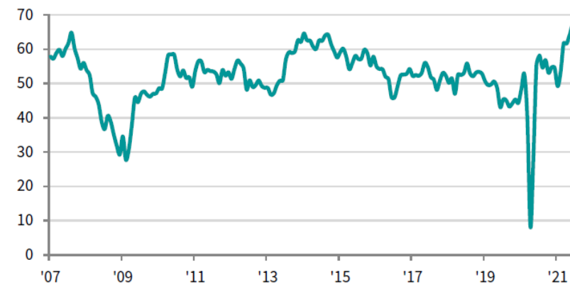
IHS Markit / CIPS UK Construction PMI Total Activity Index sa, >50 = growth since previous month