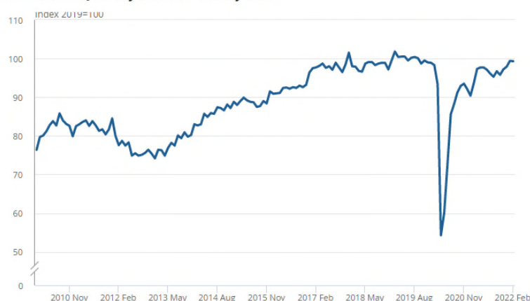
Monthly all work index, chained volume measure, seasonally adjusted, Great Britain, January 2010 to February 2022