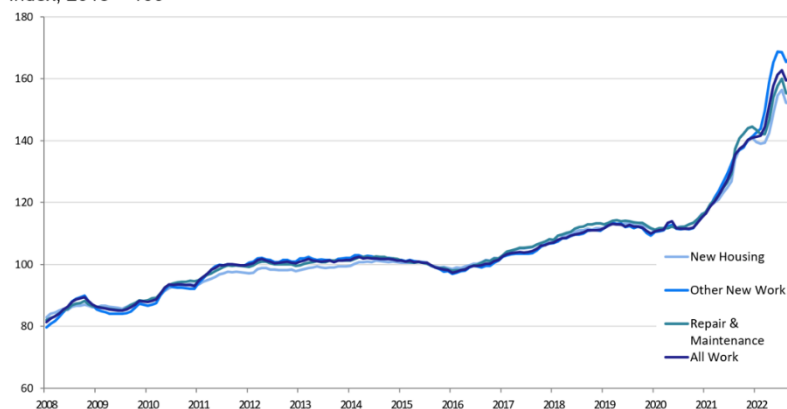
Chart 1: Construction Material Price Indices, UK Index, 2015 = 100